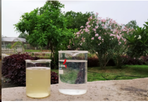
Indra Flow Series 75 KLD - F75 at Godavari Bio-Refineries Ltd., Maharashtra, India