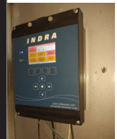
INDRA Smart & Spectrum Software Snapshot

Smart is our automation platform which optimizes systems to improve treatment efficiency, consistency and reduce operational costs. It enables remote system control, fine tuning and real time troubleshooting. Spectrum is an advanced analytics platform which provides data driven predictive analysis for better water management.